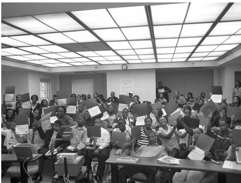
Out of the Box participants proudly display their certificates of achievement

When I first started volunteering with OOTB, I did not expect too much from the kids. I (wrongly) thought that these will be young kids that will be here early on a Saturday morning; I'd be surprised if they are even awake! As I walked into the final session, I was completely taken aback. The students had just finished brainstorming on entrepreneurial ideas. Each group then presented their ideas as if they had been professional business men and women all of their lives. They were immaculately dressed, polished, well-spoken and enthusiastic. Students were not only awake, they were interested, actively participating, and passionate. I was shocked! It proved that we often underestimate our youth. They are not children; they are young adults ready to become the next leaders of our country. And there is no better way to prepare them than to get them thinking "outside of the box."