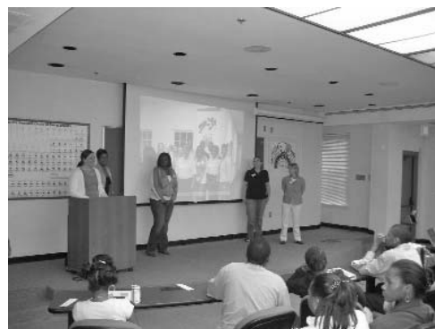
JLA volunteers congratulating Out of the Box participants

Hundreds of students have already benefited from the OOTB program as demonstrated by a 76% average increase in test scores on their financial literacy skills assessments (OOTB Fact Sheet-Student Enrollment - Metro ATL Fall08). While this program has been successful with The Junior League of Brooklyn, NY, this is the first year that OOTB has partnered with The Junior League of Atlanta. Volunteers work with the dedicated OOTB staff to help facilitate workshops on Saturday mornings. They are organized into three-week cycles with modules that include banking and budgeting, investments, credit management and entrepreneurship.