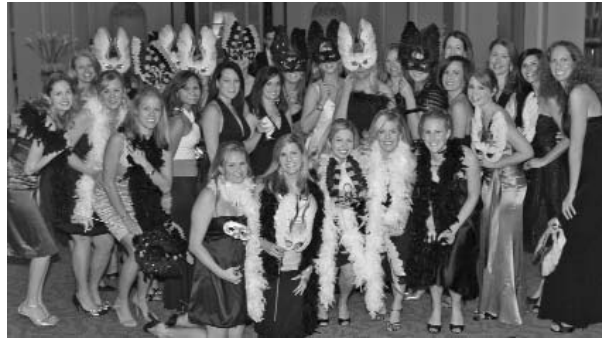
Charity Ball Committee members at the "Black & White Masquerade"

The 5th Annual Charity Ball, the Black & White Masquerade, was a huge success. On October 3, League and community members alike donned their fanciest attire, enjoyed cuisine from Atlanta's hottest restaurants, danced to the music of Atlanta Rhythm and Groove and bid on dozens of great auction items—including a fabulous Roberto Coin necklace—all to support the League's efforts on behalf of women and children in Atlanta.