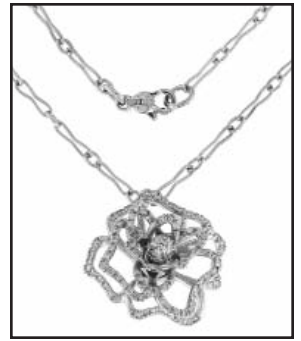
Necklace by Roberto Coin