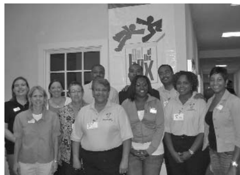
Out of the Box staff and JLA volunteers